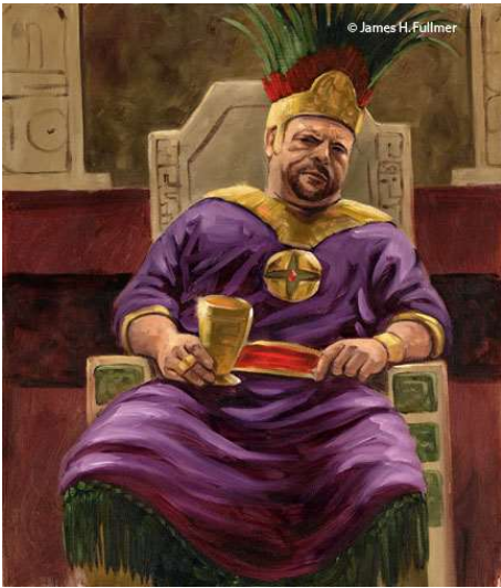
■ Mosiah 7:41 King Noah