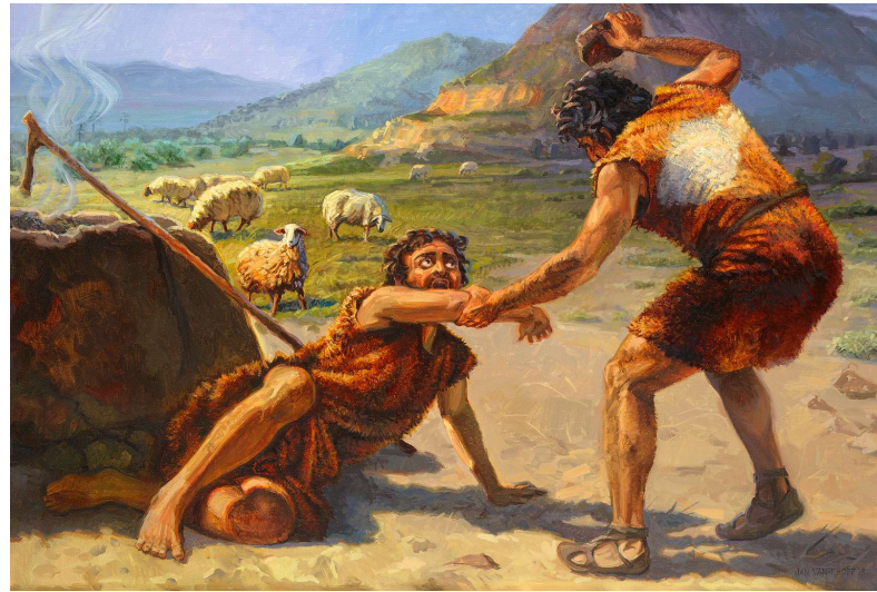
■ Genesis 5:4 Cain