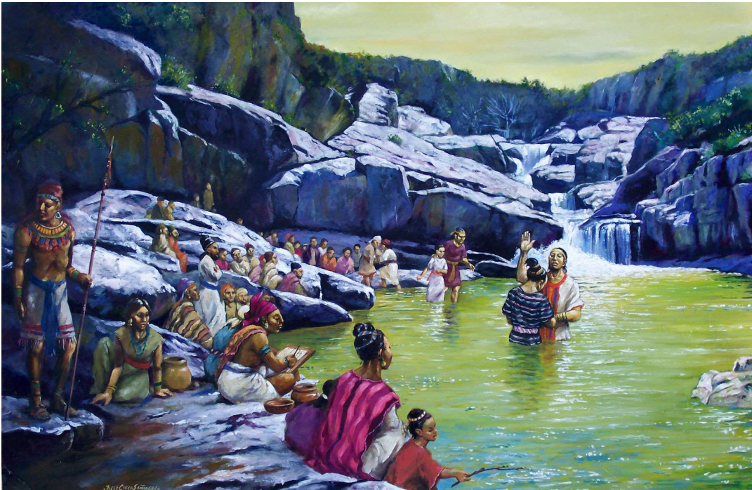
The Waters of Mormon (9:38)