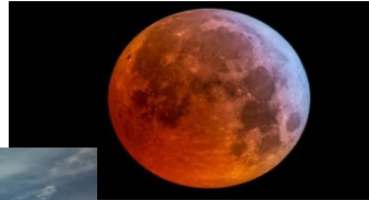
Fireball lights seen around the world

Blood Red Moons Often Stand for a Great Change and Usually Not For the Better They Often Signify War and Calamities