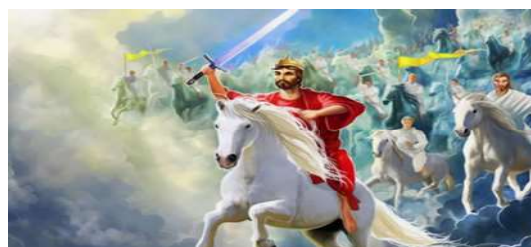
Revelations 19: 11-12

6e and they shall see me in the clouds of heaven, clothed with power and great glory, with all the holy angels; and he that watches not for me shall be cut off.