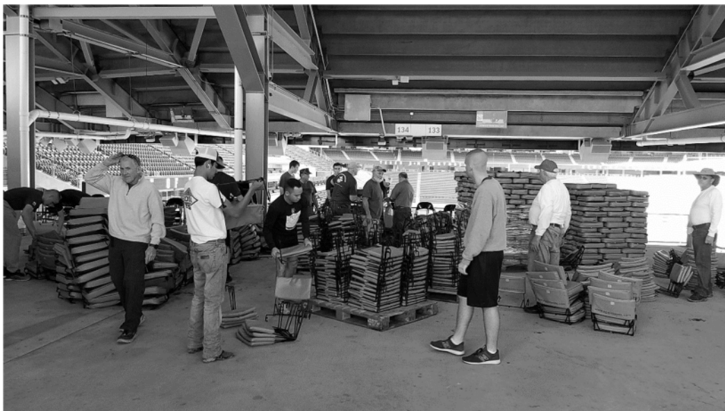
(Above: Detachment volunteers stacking seat back frames and cushions after removing them from the benches.)